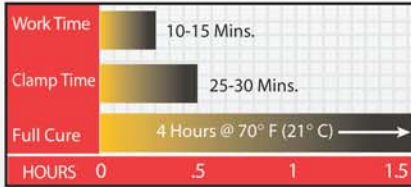
Fast Set Adhesive #812