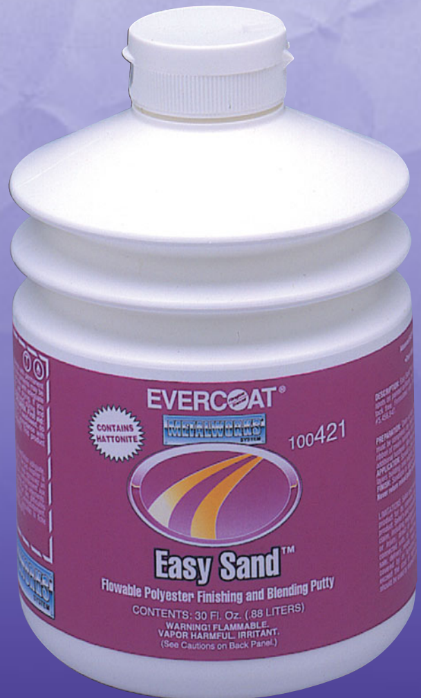
Part No. 100421 30 Oz. Pump Bottle